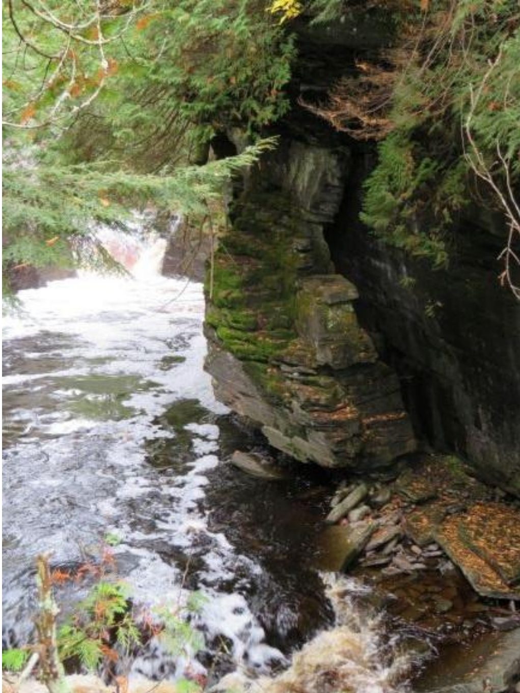
Block of Michigamme Slate in the process of being detached from the canyon wall at Canyon Falls gorge in Baraga County