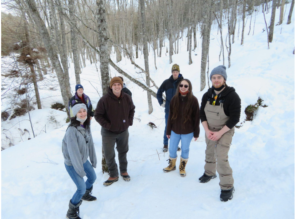
AIPG students posing at Eben Ice Caves after the icy hike to see the stalactites.