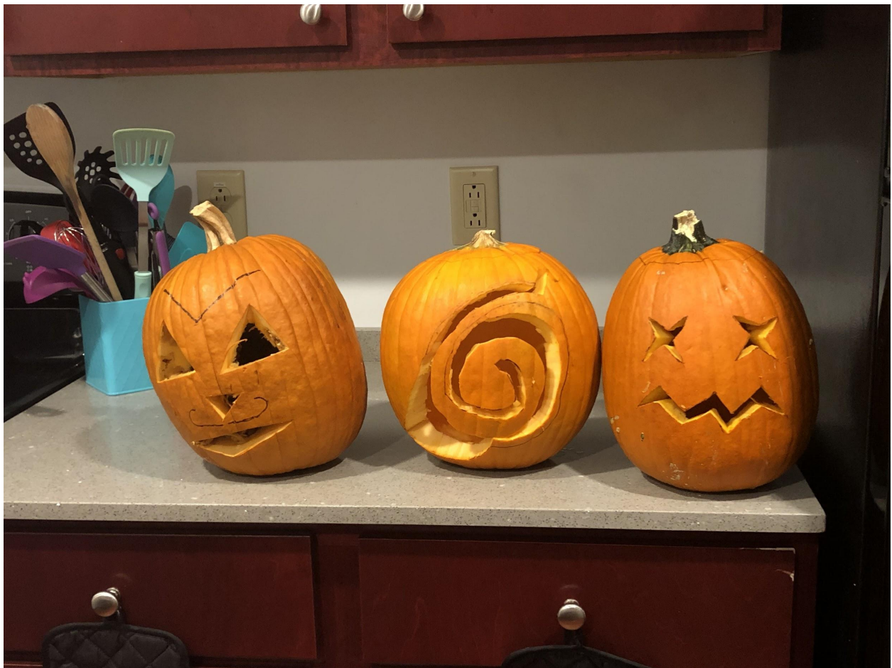
Carved pumpkins for a relaxing event with AIPG student members.

A socially distant limited gathering was planned to enjoy the holidays in order to relieve some stress in the middle of the semester. The group brought their own pumpkins to carve and the pumpkin seeds were roasted at the end of the event.