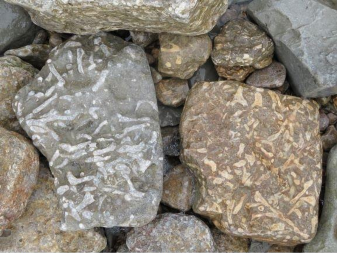
Fossiliferous shale and limestone on Stonington Peninsula beach along Little Bay De Noc