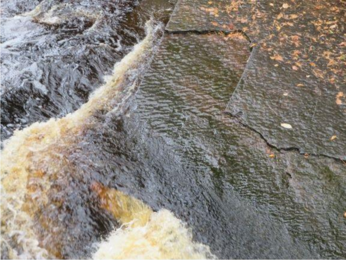
Relict ripple marks and vertical slaty cleavage in Michigamme Slate at Canyon Falls