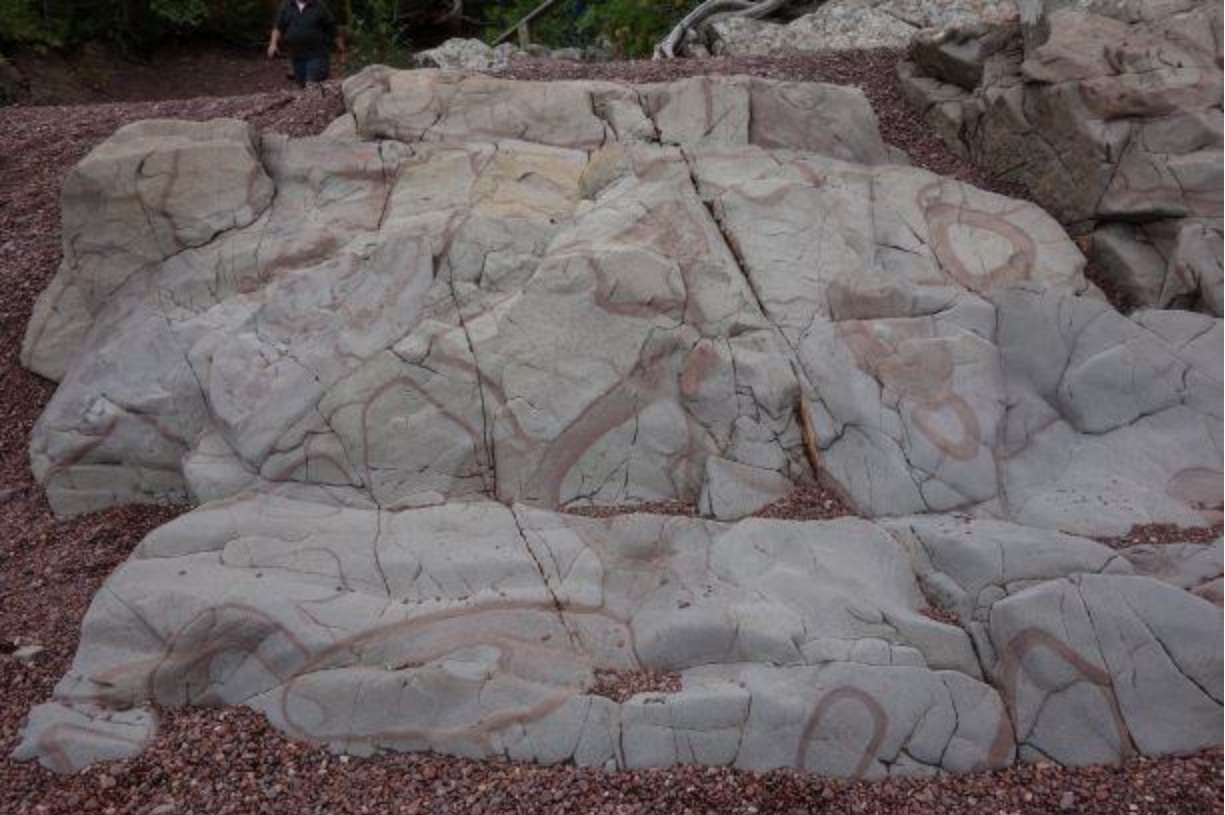
Weathering effects in Lake Shore Trap Basalts at Hunter's Point Park in Copper Harbor