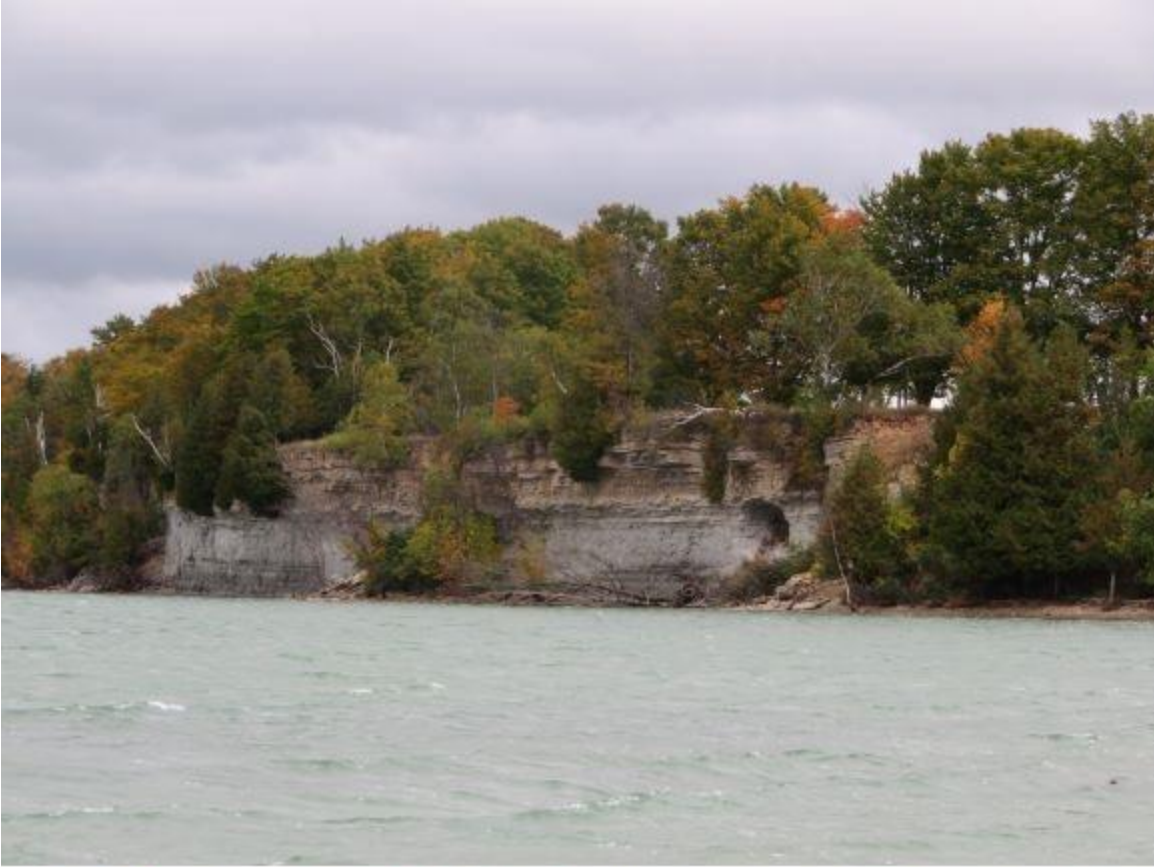
Bill's Creek Shale (gray) and overlying Stonington Limestone (tan) exposed on the west side of the Stonington Peninsula along Little Bay De Noc in Delta County