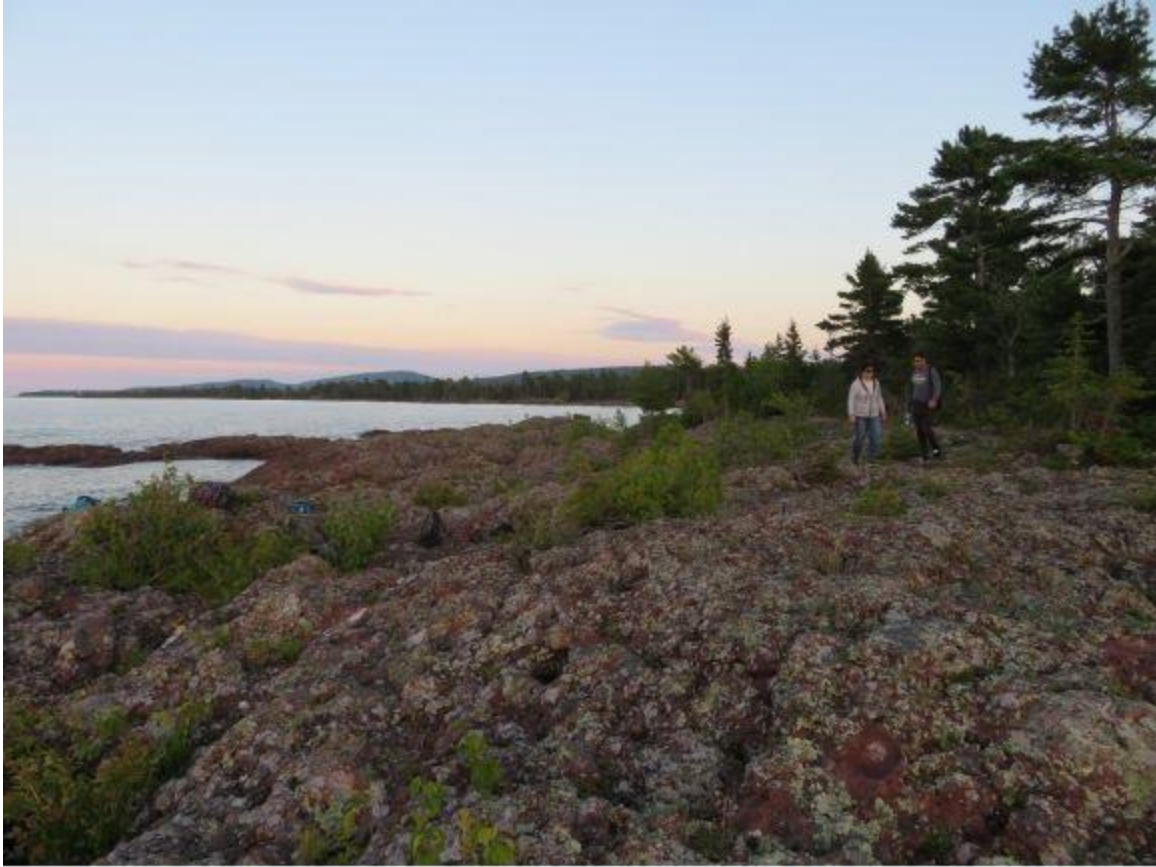
Copper Harbor Conglomerate outcrops at Hunter's Point Park in Copper Harbor