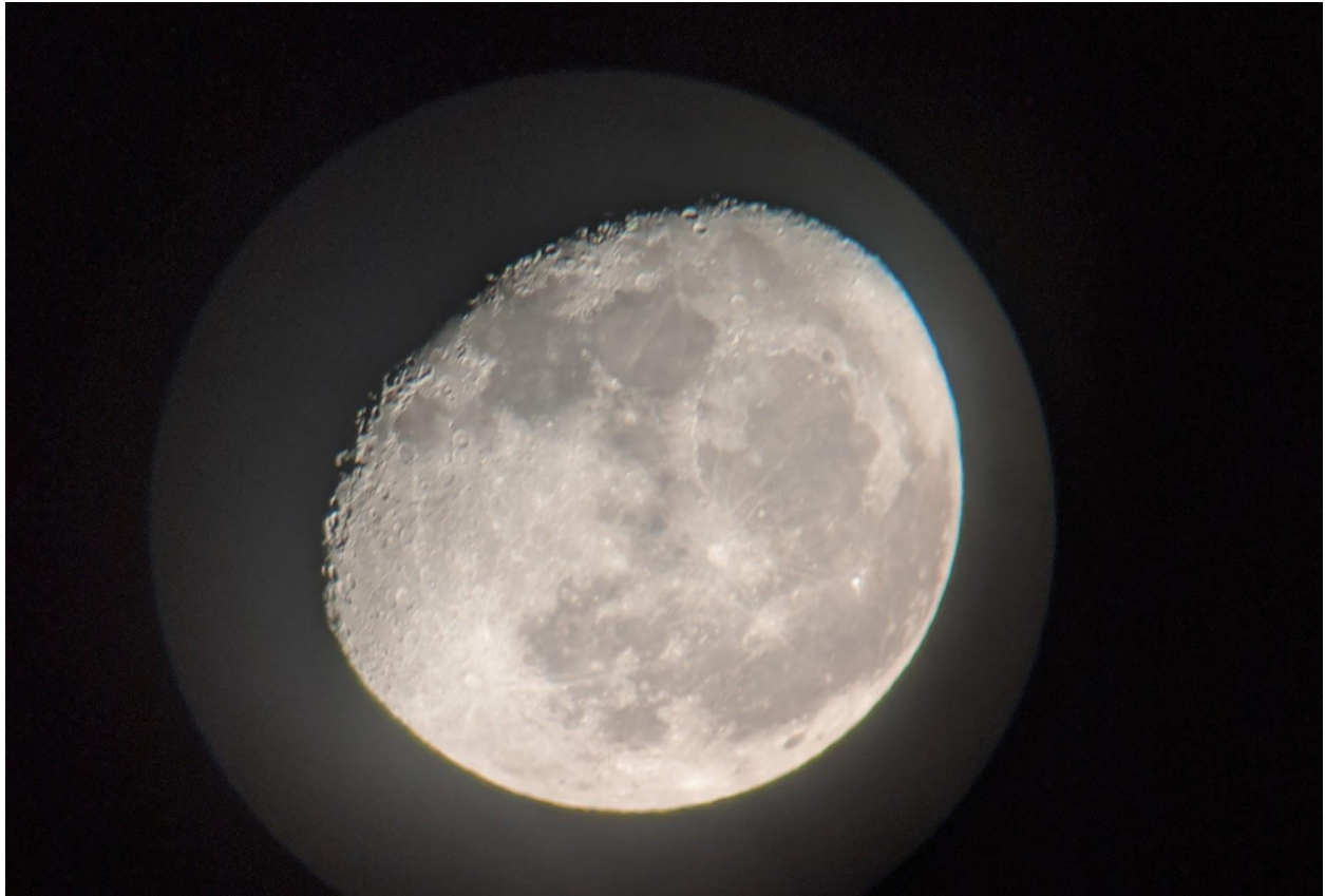
Picture of the full moon during AIPG's stargazing trip.

The student chapter started the semester with a socially distanced event at Brockway Mountain to do some stargazing as a group. The night was not good for stargazing, but it was nice to see the full moon through a telescope and in person. This event was great for seeing members after the summer break.